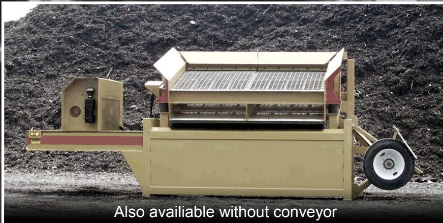
Also available without conveyor